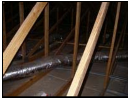
9.0 Picture 1

9.0 Large sections of the attic have no visible insulation. Recommend further evaluation and repair as needed by a qualified licensed general contractor.