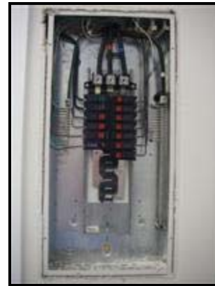
5.6 Picture 9

5.7 You should consider installing a smoke detector in every unit and at least one carbon monoxide detector per unit.