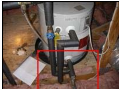
4.2 Picture 1

4.2 (1) Water heaters above unit 200, unit 100, and unit A do not have standard working access/space. The base of the water heater is rusted over unit 100. Recommend further evaluation and repair as needed by a qualified licensed general contractor and plumbing contractor.