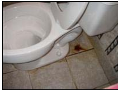
4.0 Picture 4

(4) Toilet leaks at floor at unit 100. Repairs are needed to prevent the toilet from continued leaking, a new wax seal and/or flange may be needed. Recommend a qualified licensed plumber repair or correct as needed.