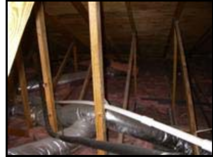
1.5 Picture 3