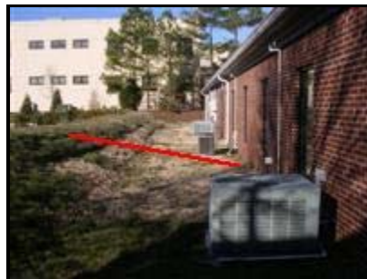
2.5 Picture 2