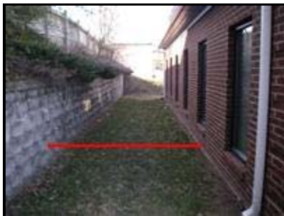
2.5 Picture 1

2.5 Negative slope towards left side (facing front), right side, and rear. The slope in this area is not likely to drain water away from the building and no swale or alternative measures other than some catch basins in the rear and right yard were visible. Repairs are advised to keep water away from the foundation. Recommend further evaluation and repair as needed by a qualified licensed general contractor.