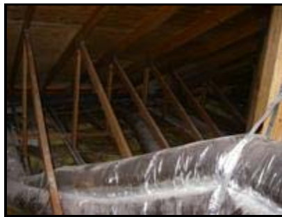
1.5 Picture 4