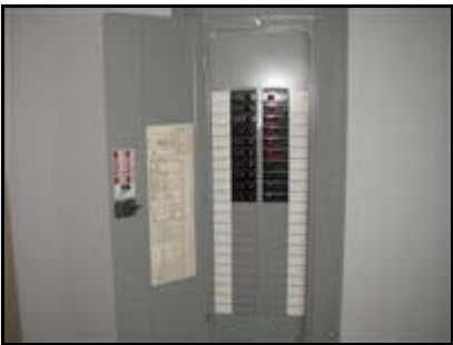
5.6 Picture 4