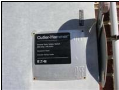
5.1 Picture 1

5.1 Power had to be turned off at the service disconnects to open the cover. We did not open the two center service disconnects, we did not want to turn off power to the current tenant. No visible issues were found, you may wish to have these two disconnects evaluated prior to closing at a time when it will not affect the tenant.