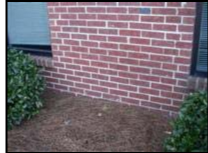
2.0 Picture 3