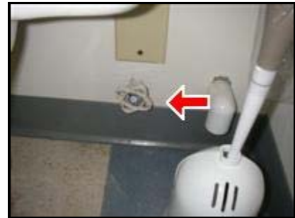
4.3 Picture 3

4.4 Gas was turned off at the 3 meters nearest the left side of the building, we will not be able to inspect the fuel storage and distribution systems or any gas components including furnaces in these units. Recommend a qualified professional from the gas company inspect when they turn the gas back on.