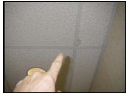
8.0 Picture 3