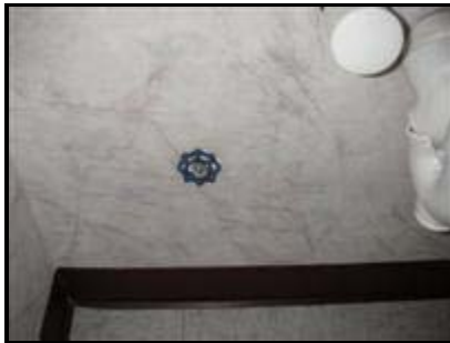
4.3 Picture 1

4.3 The main shut off are the blue knobs located on the wall under the sink in the bathroom in unit 200, under the hall sink base cabinet in unit 100 under the men's toilet in unit A. This is for your information.