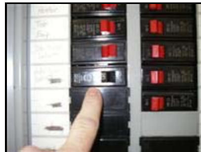
5.2 Picture 2

5.6 Unit sub panel boxes are located at unit B bathroom, unit 200 hallway, unit 100 hall closet, unit A rear right