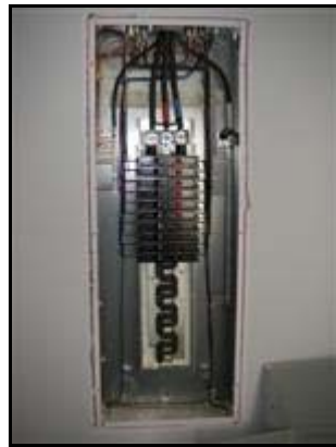
5.6 Picture 5