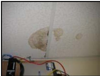
8.0 Picture 4