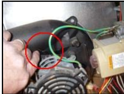
6.0 Picture 1

6.0 (1) Exhaust blower inside the furnace for unit 200 has a crack in the housing. Repairs are advised to prevent the loss of combustion gasses. Recommend further evaluation and repair as needed by a qualified licensed HVAC contractor.