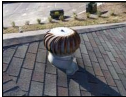
9.1 Picture 1

9.1 Turbine vent nearest the right side of the building is squeaking rather loudly. Recommend further evaluation and repair as needed by a qualified licensed general contractor.