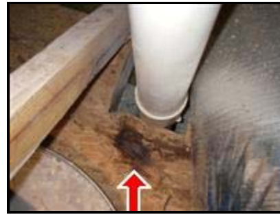
4.0 Picture 3

(4) Toilet leaks at floor at unit 100. Repairs are needed to prevent the toilet from continued leaking, a new wax seal and/or flange may be needed. Recommend a qualified licensed plumber repair or correct as needed.