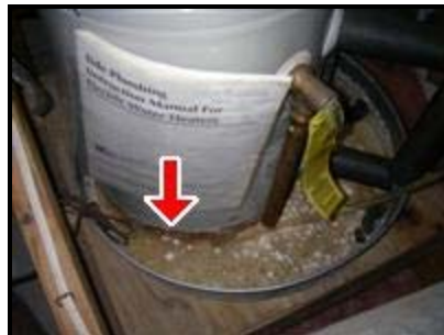
4.2 Picture 2