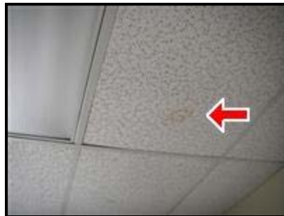
8.0 Picture 5