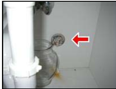
4.3 Picture 2