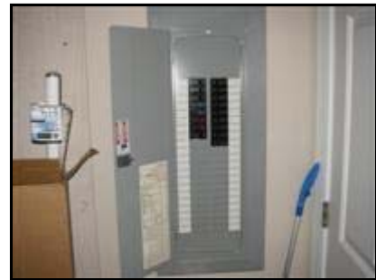
5.6 Picture 6