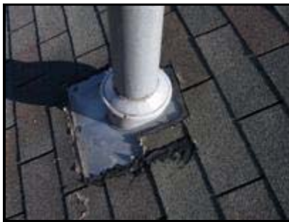
3.0 Picture 1

3.0 Roof shingles have been sealed with an elastomeric roof type sealant around the penetrations. These types of repairs should not be considered permanent or workmanlike. Recommend further evaluation and repair as needed by a qualified licensed roofing contractor.