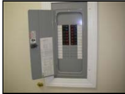
5.6 Picture 2