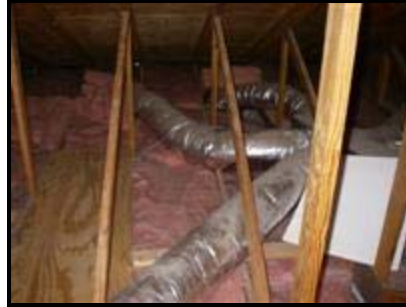
1.5 Picture 2