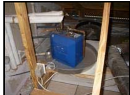
4.2 Picture 3