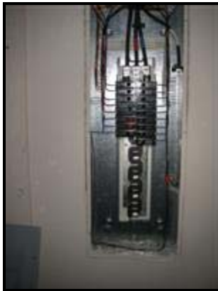
5.6 Picture 7