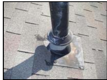
3.0 Picture 3

3.1 Flashing blocked by siding and roof shingles could not be fully inspected (FYI).