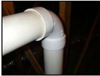
4.0 Picture 2