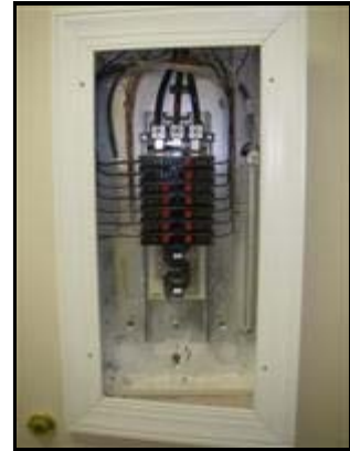
5.6 Picture 3