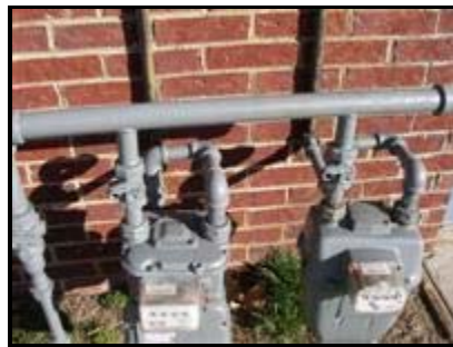
4.4 Picture 1

4.4 Gas was turned off at the 3 meters nearest the left side of the building, we will not be able to inspect the fuel storage and distribution systems or any gas components including furnaces in these units. Recommend a qualified professional from the gas company inspect when they turn the gas back on.