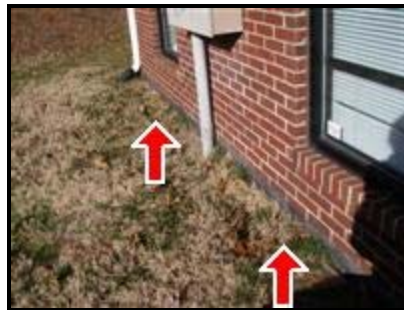
1.0 Picture 1

1.0 A bituminous coating was applied to the rear of the building near the right corner, evidence suggests this was done post construction to address a water intrusion issue. With out recent rains and personal past experience with the building we can not be sure if the corrective measures are successful. Recommend obtaining written documentation and disclosure from the owners including receipts, warranties, etc. or further evaluation and repair as needed by a qualified licensed general contractor.