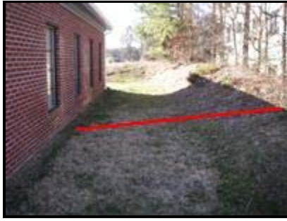
2.5 Picture 4