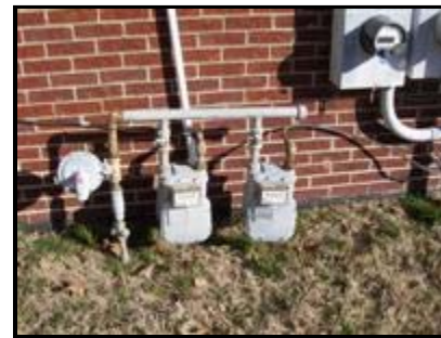
4.4 Picture 2