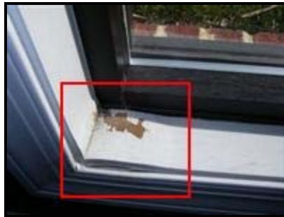
8.6 Picture 1

8.6 Evidence of leaks were inspected on the window sill on the left side in unit 100. The area was dry at the time of the inspection. Recommend further evaluation and repair as needed by a qualified licensed general contractor.