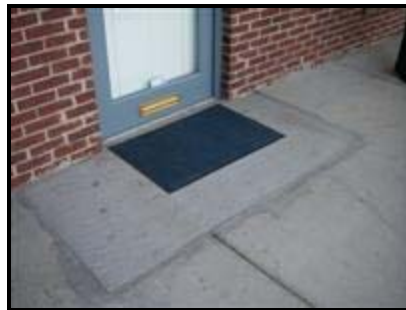
2.4 Picture 2

(2) Concrete patio near the entrance door to unit 200 was repaired/worked on at some point (FYI).