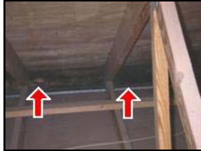
2.6 Picture 2