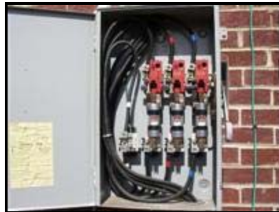
5.1 Picture 2