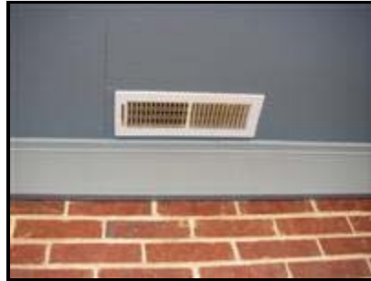
2.4 Picture 1

2.4 (1) HVAC diffuser in the exterior front porch ceiling is not connected to anything (FYI).