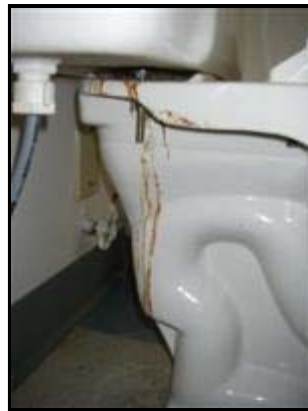
4.0 Picture 5

(5) Toilet leaks at tank mount at unit A men's and women's bath. Repairs are advised. Recommend a qualified licensed plumber repair or correct as needed.