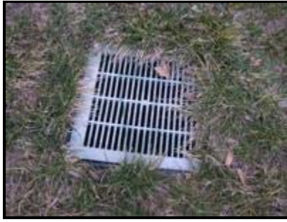
2.5 Picture 5

2.6 The eave visible from the attic has deterioration on the front of the building at the porch area and unit 100. Further deterioration is likely unless the water intrusion issues are corrected. Recommend further evaluation and repair as needed by a qualified licensed general contractor.