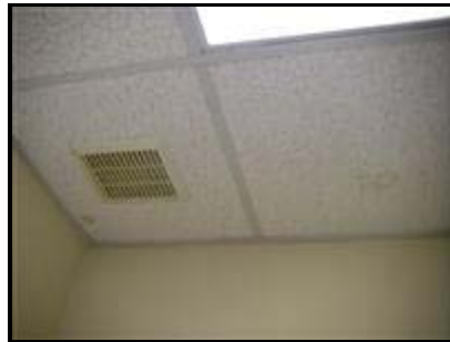
8.0 Picture 2