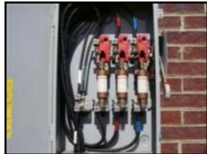
5.1 Picture 3

5.2 One circuit breaker in unit A panel is of a different brand than panel manufacturer. The manufacturer requires that in order for the panel to be safe, only Cutler-Hammer or Westinghouse brands are allowed to be used inside the panel. Even though these circuit breakers are all "UL approved," they are not approved to be used in panels of different manufacturers unless so indicated on the panel label. Recommend further evaluation and repair as needed by a qualified licensed electrical contractor.