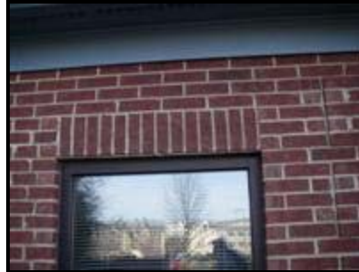
2.0 Picture 2