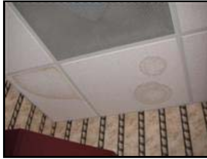
8.0 Picture 7

8.1 Walls and closets could not be fully inspected due to furniture, personal property, etc.