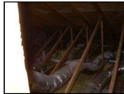
1.5 Picture 5

(2) Roof structure and attic could not be fully inspected due to finished coverings, insulation, HVAC components, plumbing, unfloored areas, water heater, limited access, etc.