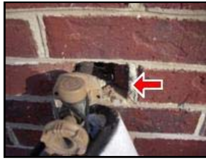
2.0 Picture 5

2.4 (1) HVAC diffuser in the exterior front porch ceiling is not connected to anything (FYI).