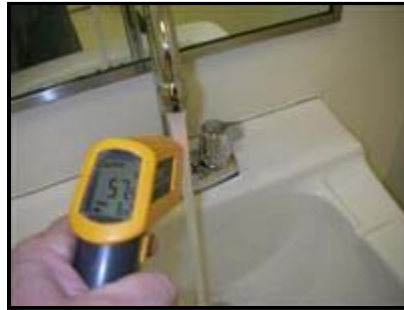
4.2 Picture 4

(2) There was no hot water in unit's B and A. Recommend further evaluation and repair as needed by a qualified licensed plumbing contractor.