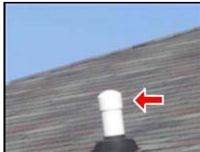
4.0 Picture 1

4.0 (1) Plumbing vent pipe nearest the right side of the building is capped, this can block/prevent proper venting and the exhaust of sewer gasses. Recommend further evaluation and repair as needed by a qualified licensed plumbing contractor.