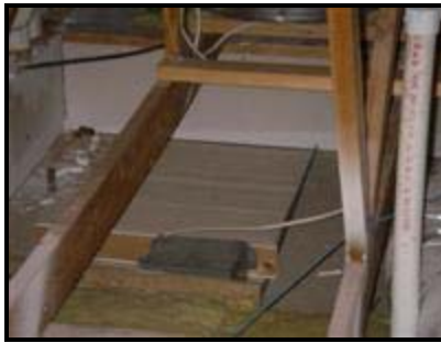
9.0 Picture 2

9.1 Turbine vent nearest the right side of the building is squeaking rather loudly. Recommend further evaluation and repair as needed by a qualified licensed general contractor.