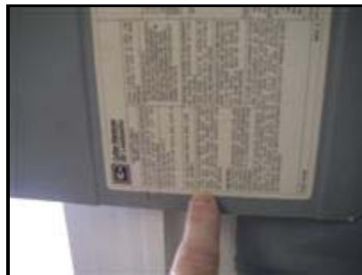
5.2 Picture 1

5.2 One circuit breaker in unit A panel is of a different brand than panel manufacturer. The manufacturer requires that in order for the panel to be safe, only Cutler-Hammer or Westinghouse brands are allowed to be used inside the panel. Even though these circuit breakers are all "UL approved," they are not approved to be used in panels of different manufacturers unless so indicated on the panel label. Recommend further evaluation and repair as needed by a qualified licensed electrical contractor.