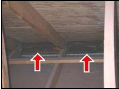
2.6 Picture 1

2.6 The eave visible from the attic has deterioration on the front of the building at the porch area and unit 100. Further deterioration is likely unless the water intrusion issues are corrected. Recommend further evaluation and repair as needed by a qualified licensed general contractor.