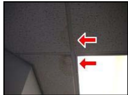
8.0 Picture 6