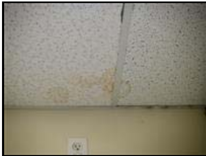
8.0 Picture 1

8.0 Stains were inspected on the ceilings in the bathroom of unit B, hallway in unit B, bathroom of unit 300, hallway of unit 300, rear office of unit 300, ceiling of unit 200, bathroom of unit 100. These could be the result of roof leaks, plumbing leaks, or HVAC related issues, they were all dry at the time of our inspection. Recommend further evaluation and repair as needed by a qualified licensed general contractor.