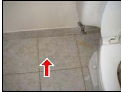
8.2 Picture 1

8.2 (1) Tile was cracked near the toilet in unit 300 bathroom. Recommend further evaluation and repair as needed by a qualified licensed general contractor.