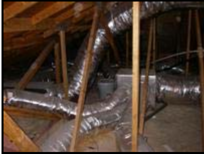
1.5 Picture 1

1.5 (1) The web members in the attic over the left and right end units had no permanent lateral and/or diagonal bracing. Detailed information on bracing is available at BCSI-Guide to good practice for handling, installing, restraining, & bracing of metal plate connected wood trusses . The truss drawings should be carefully reviewed by the construction engineer of record, bracing should be installed in accordance with the truss drawings. You should ask for written verification that all required permanent bracing was properly installed or have the truss drawings reviewed for compliance by a licensed professional engineer.