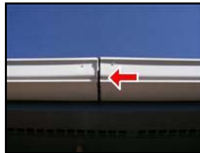
3.3 Picture 2