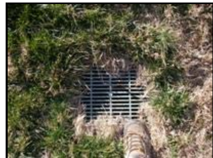
2.5 Picture 3