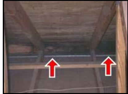
2.6 Picture 3