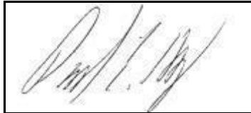
11.0 Picture 1

11.0 Inspector's Signature, NC General Contractor # 52436, ASHI Certified Member 244121, Certified Master Inspector, PAHI-President, Angie's List Super Service Award Winner 2009-2008-2007-2006.