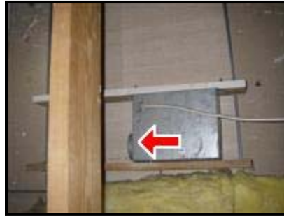
9.2 Picture 1

9.3 Thermostatically controlled vent fan in attic turned freely with hand which indicates the unit may work, but due to the low temperature the unit would not come on at its lowest setting. We did not inspect this unit. . .