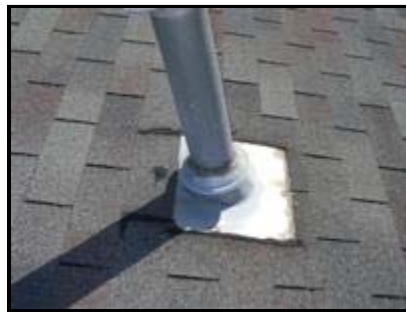
3.0 Picture 2