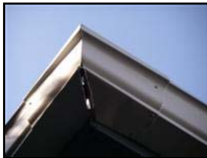
3.3 Picture 1

3.3 Gutter(s) leaks at seams around the building. Gutters that drain poorly or clogged can lead to many costly problems such as deterioration of fascia, soffit or roof edge. It can also cause gutters to pull loose and lead to possible water intrusion. Recommend a qualified licensed general contractor inspect and repair as needed.