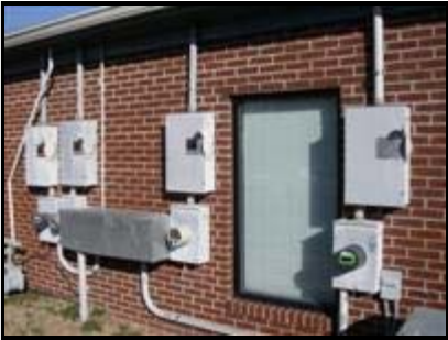
5.6 Picture 1

corner room. However, main disconnect (shut-offs) are outside at meter base panel (for your information).