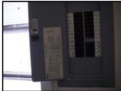
5.6 Picture 8