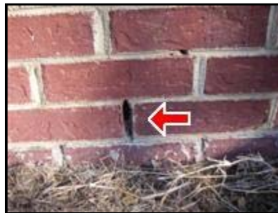
2.0 Picture 4 weep hole

(2) Large hole in the veneer around the rear hose bib should be professionally sealed to reduce water and pest intrusion. Recommend further evaluation and repair as needed by a qualified licensed general contractor.